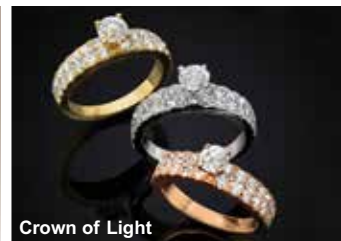
Crown of Light